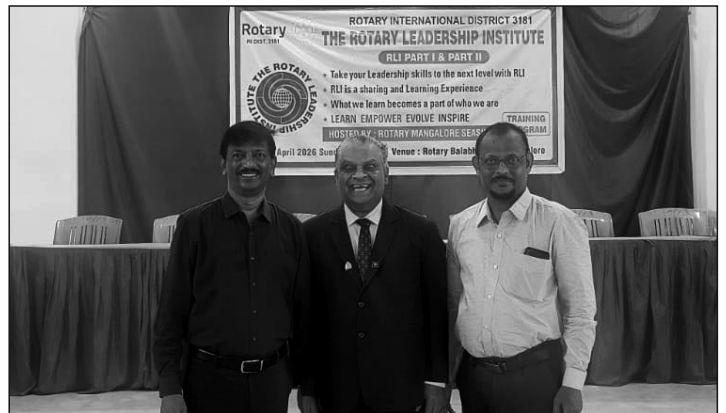
Our Club delegates seen with the inaugurator of the Rotary leadership institute held Rotary Bala Bhavana recently