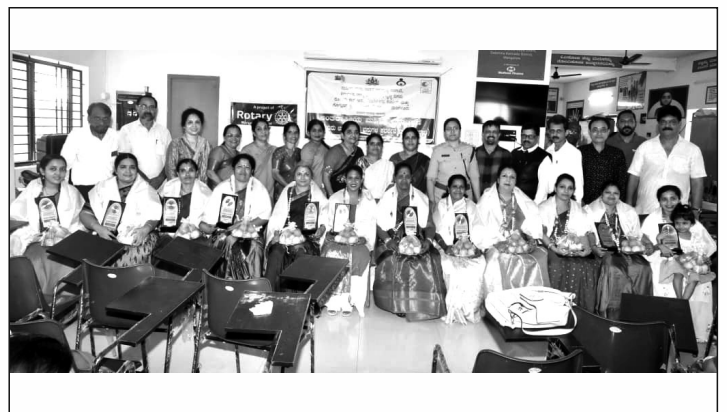
Celebration of Women's Day by Our Club