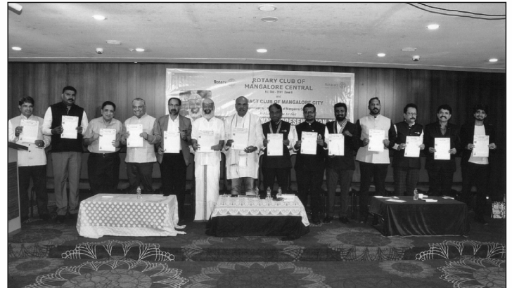
Release of Centor by the hosts of the March Dinner Meet of the club