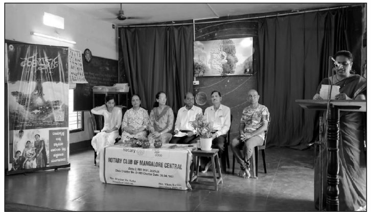
The Screening of the 29 th Show of Hari Dhwarna by Our Club