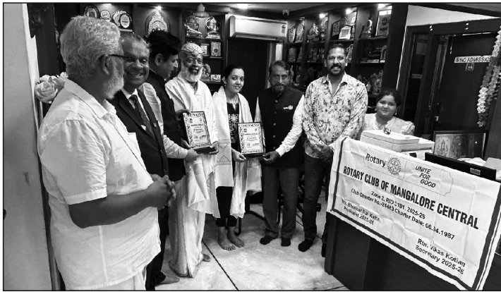
Participation by Our Club in the 363rd episode of Business Tonic