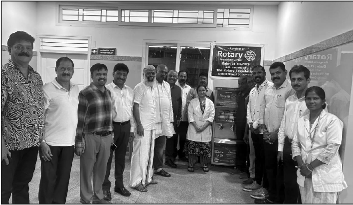
Donation of a Drinking Water Facility by Our Club to Primary Health Center, Jeppinamogaru