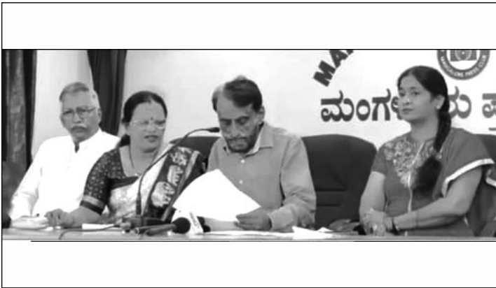
Press conference conducted by Our Club regarding the Women's Day Celebration